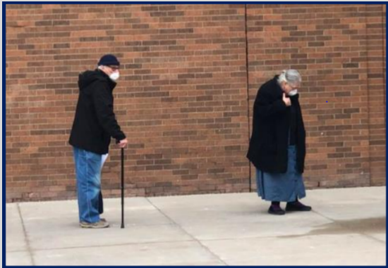
The line to vote in the Wisconsin 2020 Primary Election

Our faith also calls us to prioritize the preservation of life and wellbeing. COVID 19 and, in some cases, failed policy responses to the pandemic, is endangering lives. Policies that force people to choose between their health and their right to vote are wrong. Voting in November is both a public health issue and continues to be a racial justice issue since people of color are both more susceptible to COVID-19 infection and more likely to experience long lines and congestion at the polls.